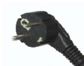
DIN49441 16A plug